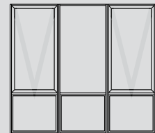
Double awning with centre fixed light over triple fixed light

Contact your local Platinum dealer for further details.