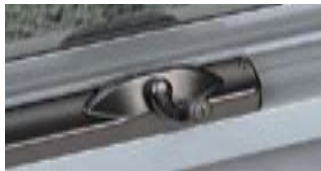
Ergonomically designed handle