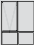
Awning and fixed light over double fixed light

Awning windows can be manufactured to your preferred window height with customised galleries available.