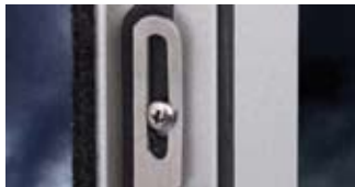
Fully adjustable sash keeper