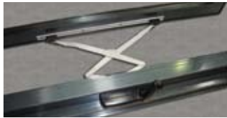
Stylish smooth opening