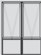
Double awning over double fixed light