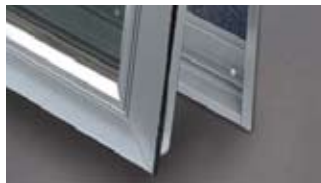
Substantial mitred sash profiles